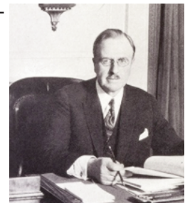
Illus. 24: Mayor Hylan

In the early 1920s, Mayor John F. Hylan strongly advocated building an independent subway system to be owned and operated by the city. He rightly argued that subways should be "planned, built, and operated to accommodate the transportation needs of the people...and not solely for the financial advantage of the operating companies or their officials." 21