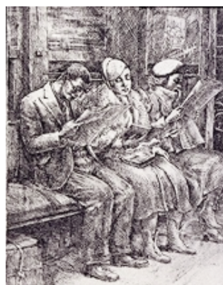
Illus. 3: Etching of Passengers in the Subway by Reginald Marsh