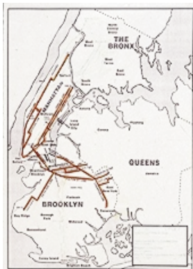
Illus. 4: Map of Elevated Lines