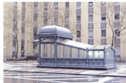
Illus. 17: Astor Place Replica of Kiosk

They're gone now, except for a replica at Astor Place, but these kiosks made the transition from the bright outdoors to the darker underground more graceful.