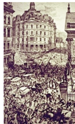
Illus. 5: Street Congestion

The first successful rapid transit in New York was affected by this warfare between good will and ill will. The elevated railroads