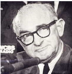
Illus. 25: Michael J. Quill

Since 1940 the operations of the three once separate subway systems and the buses, and transfer opportunities between them-including through the introduction of MetroCard-have become more and more integrated, which has made for a more efficient relation of the opposites of one and many. Just as each of us is one person, trying to make useful sense of the many people and situations we meet every day, so over the years the many separate segments of the public transportation networks in New York City have increasingly become a single system working for one purpose: efficiently carrying millions of individuals to their destinations every day.