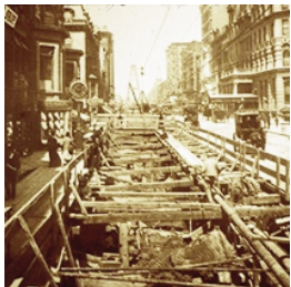
Illus. 11: Cut and Cover

The opposites of surface and depth, on top and underneath were central in the construction of the subway. As a geologist, it means everything to me to have learned from Aesthetic Realism that the structure of the earth, like the structure of our very selves, is aesthetic—a oneness of opposites. Indeed, the geology of Manhattan that the subway had to traverse is complex, ranging from hard rock a half billion years old to quicksand and other soft soils. Most of the nine-mile route was constructed by a method called "cut-and-cover": men using mostly picks and shovels, drills, and other hand tools began to dig out the right-of-way for the subway line under the street, installing a temporary wooden street surface—as this photograph shows—and shoring it up as they excavated to the proper depth; then building the tunnel; and restoring the street above. Clearly, during construction, the street surface and excavation for the tunnels were in a mobile, changing relation of depth and surface as the work progressed.