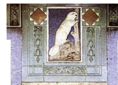
Illus. 20: Beaver at Astor Place

Most of the original subway cars were built with frames and structural members made of steel, while their sides were wood painted a deep, rich, wine red, with orange trim; 15 such a train is shown here at City Hall Station, with its beautiful Guastavino tiles. However, because of concerns about the safety of wooden-sided cars running underground, the IRT gradually replaced them with the world's first all-steel railway cars—