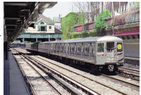
Illus. 15: Brighton Line at Cortelyou Road