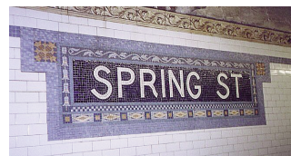
Illus. 18: Spring Street Station