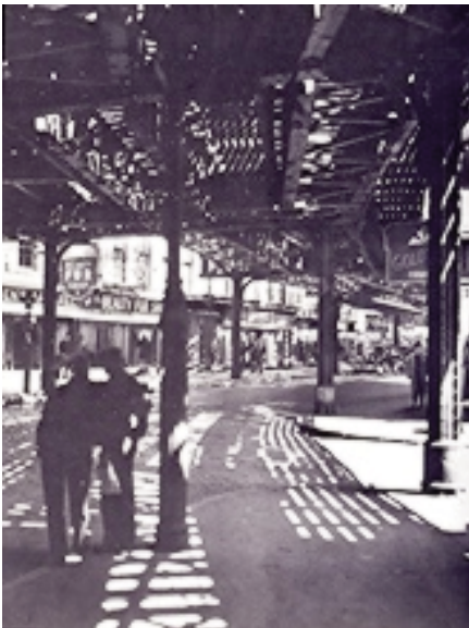
Illus. 8: Shadows Under Elevated

For two decades the elevated lines effectively filled the need for rapid transit to serve the growing city. But the els were noisy and darkened the streets above which they ran—as this photograph by Berenice Abbott