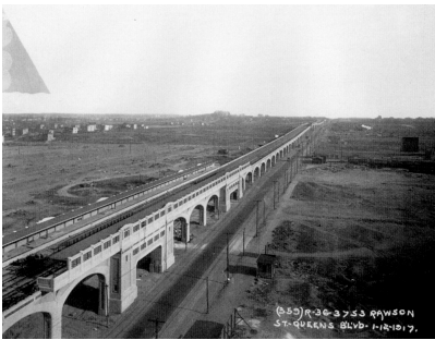
Illus. 23: Flushing Line Just Before Opening (1917)

The results of this subway expansion were dramatic. Between 1910 and 1940 population densities decreased markedly in the older districts, while the number of residents grew from 300% to 500% in northern Manhattan, the northern and eastern Bronx, in western Queens, and the south half of Brooklyn. 20