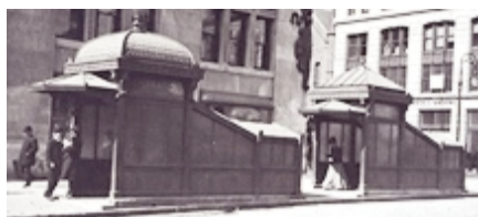
Illus. 16: Two Original Kiosks

When I hid, it was not for a good purpose, but to get away from a world and people I saw as messy-not worthy of getting mixed up with my feelings. Having the subway hidden beneath the ground, however, is for a very different purpose: it enables the city above and the people there to operate more efficiently.