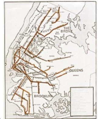
Illus. 22: Map of Dual Contracts

hammered out in 1913 between the city and the two private companies, the IRT and the Brooklyn Rapid Transit Company (later the BMT), to build more than a dozen new subway lines—marked in red on the map. 19 This unprecedented expansion of rapid transit alleviated some of the dangerous overcrowding in the Lower East Side and elsewhere, and provided the catalyst for the development of vacant lands into extensive new residential neighborhoods, where millions of people could live with dignity and comfort, and easily travel to Manhattan's employment centers. For example, this view eastward along the new Flushing line shows mostly empty space that in the next 20 years would be filled with factories, houses, and apartment buildings.