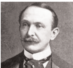
Illus. 9: August Belmont, Jr.

to get the subway built. Yet many voices even then strongly advocated municipal ownership and operation of the subway.