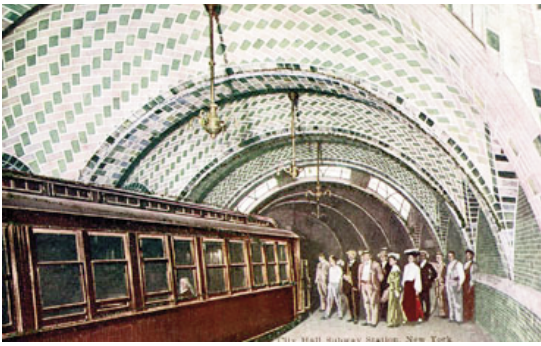
Illus. 21: Original Subway Cars at City Hall Station

some of which were running in the subway from opening day.