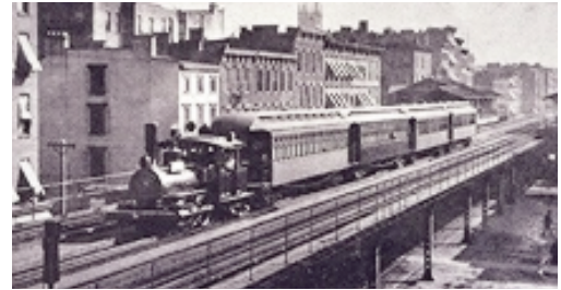
Illus. 7: Elevated Train on Sixth Avenue