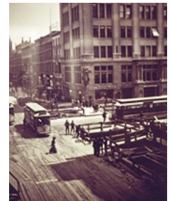
Illus. 12: Cut and Cover with Temporary Street Surface.

The builders encountered a subsurface crowded with water, sewer, steam, and gas pipes, telephone and electric conduits, and even underground streams, for which no comprehensive maps existed. These utilities had to be relocated and rebuilt as construction proceeded. Much of the remainder of the route, in Murray Hill and later Washington Heights, required tunneling through hard rock, some of which was dangerous to workers because of unexpected zones of shattered and unstable rock and underground springs. As a result during construction 54 men lost their lives, out of 7,700 predominantly Irish and Italian laborers. 10 I have often asked myself, What did these men feel working day after day under such difficult and even hazardous conditions for four years?