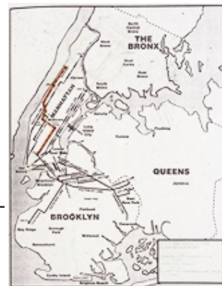
Illus. 1: Map of First Line

He and other dignitaries proceeded down into City Hall station for the inaugural ride up the East Side to Grand Central Terminal, then across 42nd Street to Times Square, and up Broadway to West 145th Street: 9 miles in all (shown by the red lines on the map). It was a momentous event in the 280-year history of the metropolis.