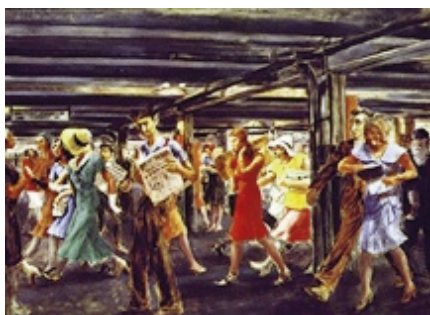
Illus. 2 : Painting of People in Subway by Reginald Marsh