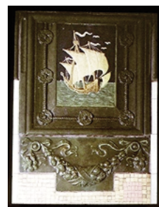
Illus. 19: Ship at Columbus Circle