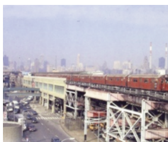
Illus. 14: Red Cars on Elevated, Flushing Line

"Do you think you are like a rolled-up map? A human being unfolds himself like a map or he can roll himself up and be concealed like a lost scroll. Do you believe you would like to hide what you are?" "Yes," I answered. I came to see there was something I wanted more than being concealed like a lost scroll, thinking I'd fooled everybody. What I really