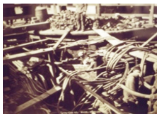
Illus. 13: Underground Utilities

The builders encountered a subsurface crowded with water, sewer, steam, and gas pipes, telephone and electric conduits, and even underground streams, for which no comprehensive maps existed. These utilities had to be relocated and rebuilt as construction proceeded. Much of the remainder of the route, in Murray Hill and later Washington Heights, required tunneling through hard rock, some of which was dangerous to workers because of unexpected zones of shattered and unstable rock and underground springs. As a result during construction 54 men lost their lives, out of 7,700 predominantly Irish and Italian laborers. 10 I have often asked myself, What did these men feel working day after day under such difficult and even hazardous conditions for four years?